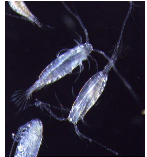
Copepod Acartia (Acartiura) clausi